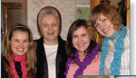
Esther's House girls with housemother