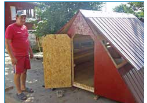
EBA built a new home for mama and baby pigs