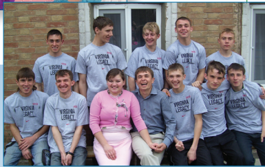
Mel's House boys with houseparents