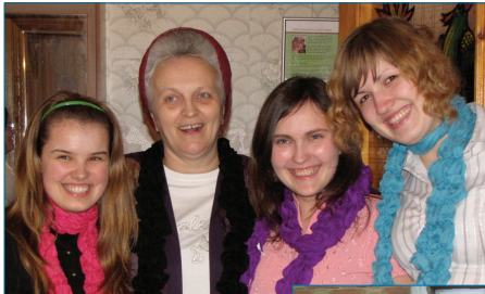
Esther's House girls with house-mother