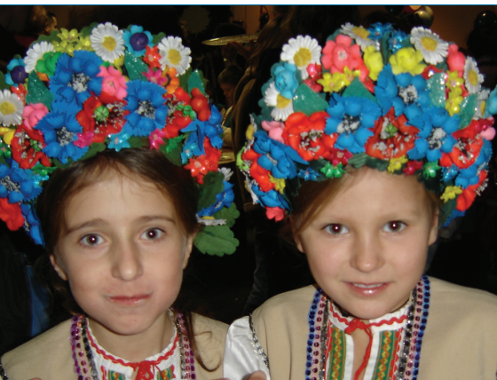
“Old Russian Shoemaker” choir members

These teens are going through an absolutely critical time to succeed in life, and the alternatives are not at all good. Support for these programs is vital, as is encouragement for house parents.