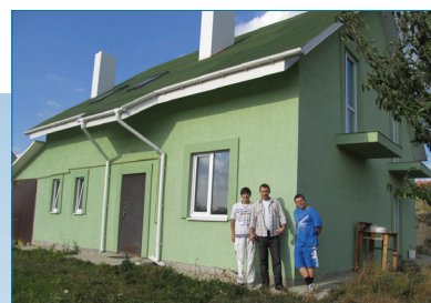
Two orphan residents pictured with housefather in front of Daniel's House

This is part of the bigger vision... to equip orphans to live on their own, be productive, impact their community and eventually impact their nation. H4O wants orphans to have a hope and a future!