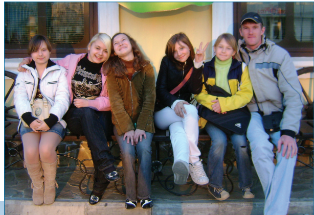
Housefather with orphan teen residents in our first group home